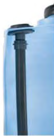
Internal Drop Pipe