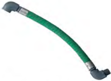
Flexible Connection (HOSE W/MNPT UHMWPE)