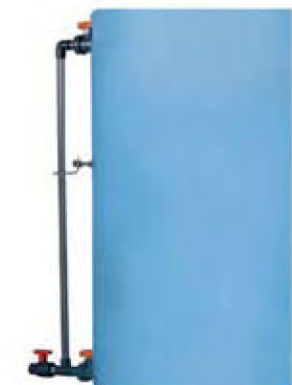
PVC Liquid Level Gauges (LEVEL GAGE STD TYPE)