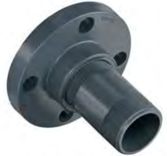
Flange Adapter (FLG ADPT)