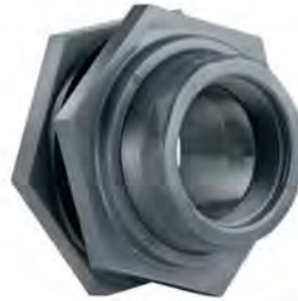
Bulkhead Fitting (BHF)