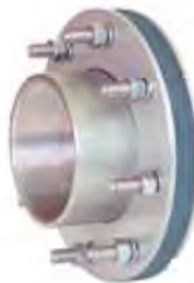
SS Bulkhead Fitting Coupling (SS BHF ASMLY CPL)