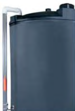
Reverse Float Level Gauges (LEVEL GAGE FLT TYPE)