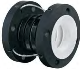
Expansion Joints (FLX JNT w/ optional FLG)