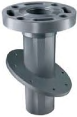
Made-Vertical with Optional Flange Adapter (DOME FTG TTD STYLE)