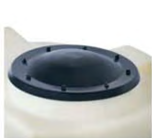
Bolted Manway Cover (CVR ASMBLY)