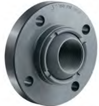
Self Aligning Universal Ball Dome - Flange Style (UBD FTG FLG STYLE)