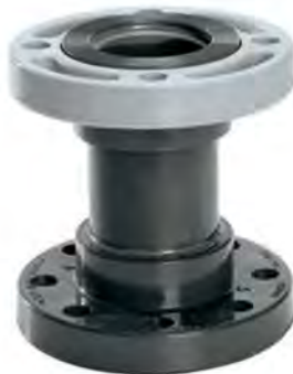
Bolted Spool Fitting (BLTD SPOOL FTG)