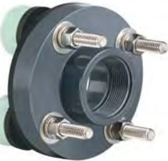
Bolted Flange Fitting (BLTD FLG FTG)