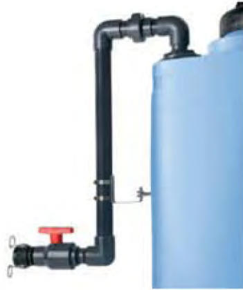
Fill Line Assembly with Optional Ball Valve, Quick Adapter & Cap