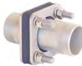
SS Bulkhead Fitting Full Nipple (SS BHF ASMLY FL NPL)