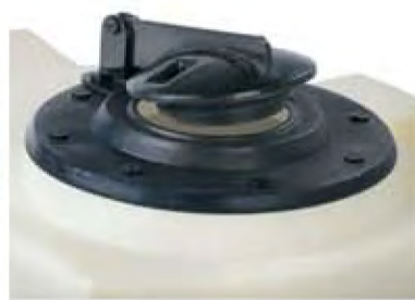
SAFE-Surge™ Emergency Pressure Relief Cover