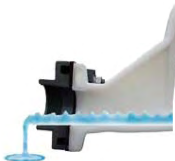
IMFO® Integrally Molded Flanged Outlet