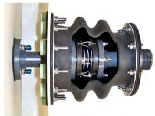
SAFE-Tank® Enhanced Bellows Fitting (TRNS FTG BELLOW STYLE)