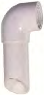
Siphon Leg or Dip Tube