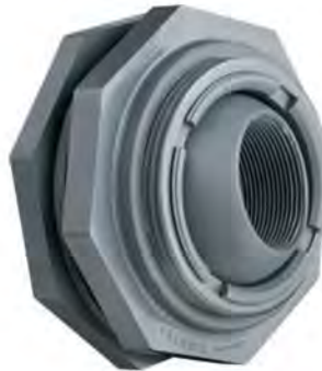
Self Aligning Universal Ball Dome - BHF Style (UBD FTG BHF STYLE)