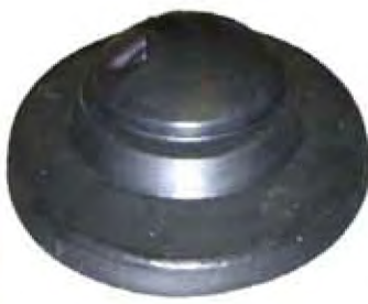
Combination Manway Cover (CVR ASMBLY COM)