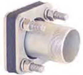
SS Bulkhead Fitting - Half Nipple (SS BHF HALF NIPPLE)