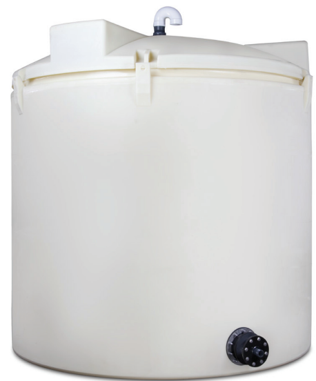
110% containment SAFE-Tank®

Contact Us at 866-765-9957 (866-PolyXLPE) E-MAIL: SALES@POLYPROCESSING.COM