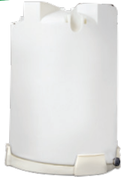
Full drain IMFO® Slope or Flat Bottom